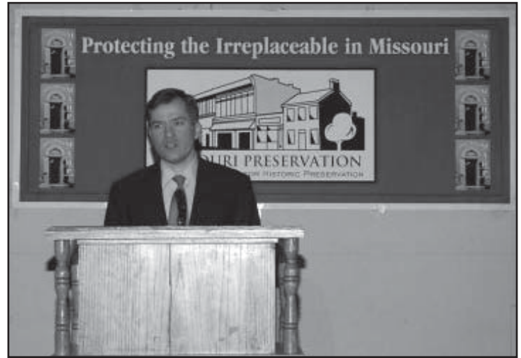
Governor Blunt Speaks at the 2007 Honor Awards

* Projects made possible in part by Missouri Historic Rehabilitation Tax Credits.