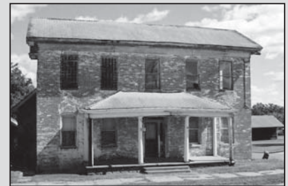
Ralls County Sheriff Office and Jail