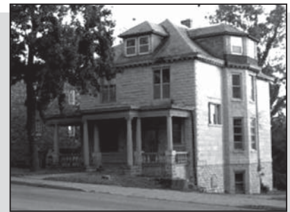
McCarty Street House